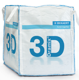
BAGS 10 kg 20 kg